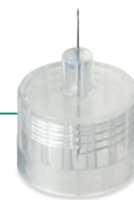
Disposable needle for pen-injector

Let's work together to help make diabetes patients' lives happier.