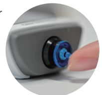
High accuracy blood glucose measurement technologies